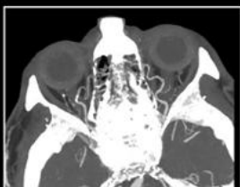
NAEOTOM Alpha Increased visibility of smaller vessels in CT scans

siemens-healthineers.com/no/computed-tomography/photon-counting-ct-scanner/naeotom-alpha/pcct-neurology