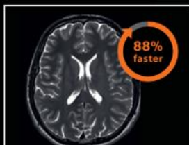
Deep Resolve Faster MR scans than ever before

siemens-healthineers.com/no/computed-tomography/photon-counting-ct-scanner/naeotom-alpha/pcct-neurology